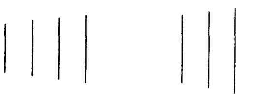
Figure 1: Tajfel and Wilkes 1963 Study 127

In a 1963 study conducted by Tajfel and Wilkes, participants were asked to estimate the lengths of lines with and without category labels. 128 Half the participants were shown two sets of lines without category labels and half were shown the same two sets of lines with category labels (four short lines labeled "A" and four longer lines labeled "B"). 129 Participants shown category labels described the lines within category A as more similar in length and reported a greater difference in line length between the category A and B lines. 130 "In other words, the labels made the examples within a category more similar and the differences across categories more distinctive." 131